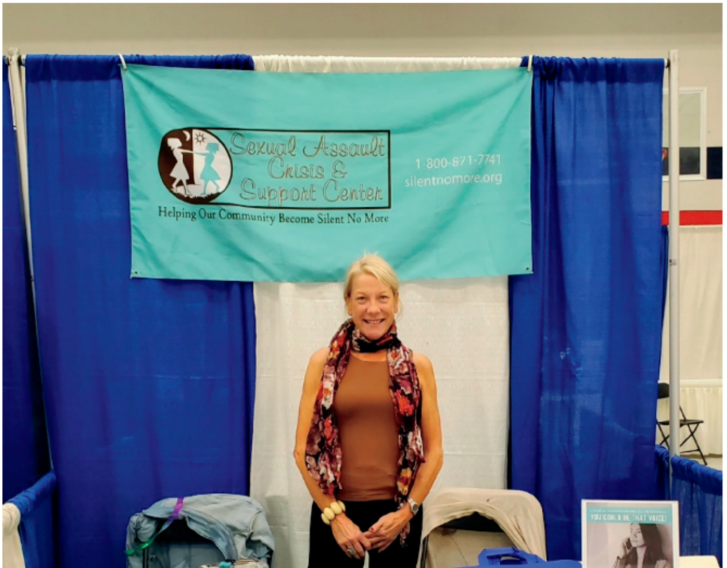
Tabling at the 2022 Successful Aging Expo

While there is no single type of survivor, characteristics commonly associated with sex trafficking survivors in Maine are white, female, and around 14 years old, which is why it's so essential that teachers and young people receive this information and know what CSEC looks like.