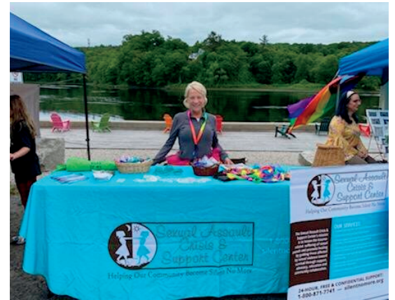
Hallowell Pride, 2022

Research has shown that the best way to reduce sexual violence is through primary prevention. This comprehensive curriculum will provide consistency for students across the state and expand access for teachers who cannot bring in an outside Sexual Violence Prevention Educator.